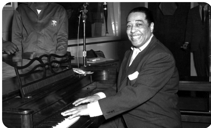
Saturday’s conference program includes a presentation on Duke Ellington.

Throughout the rest of Thursday, topics include American record labels, including Christian labels, Gennett, RCA, and the small indie label, Neutral. International music will be the topic of the early afternoon, which will include the field recordings of traditional music from Québec, followed by a panel on Greek music in