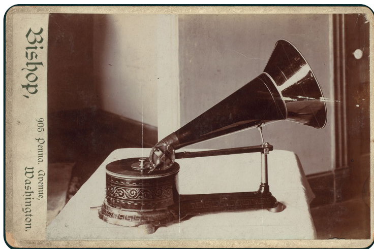
Gramophone With Cylindrical Base. 1871. Photograph. https://www.loc.gov/item/berlp1066/.